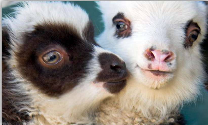
Lambs