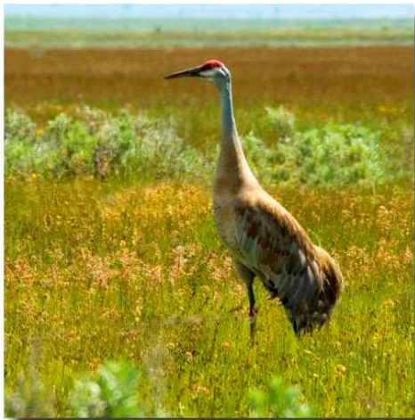
Sandhill Crane by Jim White

Blackbirds, and almost a River Otter who was watching Swallows building nests under a bridge.