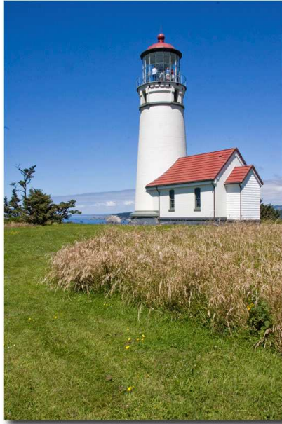
Cape Blanco, Oregon

Cape Blanco is the oldest original lighthouse in Oregon. Completed in 1871 it is recently restored and in very nice shape. The Cape Blanco area is very photogenic with great views to the north and south.