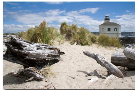
Coquille River, Oregon

The Coquille River Lighthouse is an interesting area. The lighthouse sits at the mouth of the Coquille river and there is a long cement pier and rock jetty that is strewn with very large bleached logs and driftwood of all sizes.