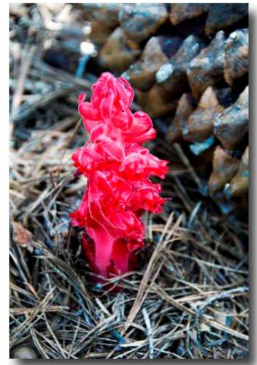
Snow Flower by Jim White

sometimes called Snow Flowers. This very bright red plant is a saprophyte, living on decayed organic matter and found this time of year wherever old growth Red Fir or Yellow Pine forest have lots of downfalls or forest litter. Drive slowly down a backcountry forest road keeping an eye for the bright red flash of the afternoon sun on this plant. When you find one, a closer exam on foot often reveals many others as it did for us.