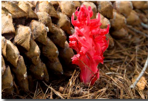
Snow Flower by Jim White

Don't pass up the National Forest for early spring photo opportunities. Exploring in the Tahoe National Forest near Emigrant Gap on June 6th we found it too early for forest wildflower in general at that altitude. This of course is the perfect time to look for SnowPlants,