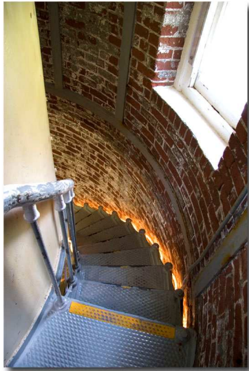
Heceta Head Stairs

I love the coast and am naturally attracted to lighthouses. California, Oregon and Washington have an abundance of lighthouses. A great many of them are open to the public and are operated by the state park system of that particular state. Many will allow you to climb to the top and see the fresnel lens. Augustin Fresnel invented a lens in 1822 that