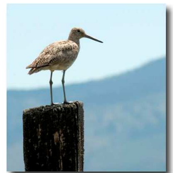
Willet