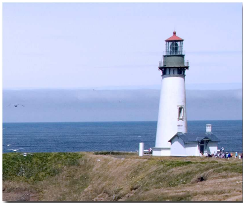
Yaquina Head, Oregon

Yaquina bay lighthouse is a lightkeepers house with light. You can tour the house and see all the original furnishings and get a feeling for the way the keepers lived.