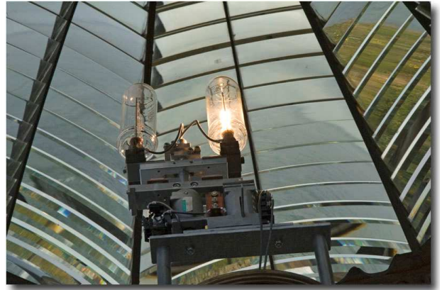
Heceta Head Fresnel & Light

I love the coast and am naturally attracted to lighthouses. California, Oregon and Washington have an abundance of lighthouses. A great many of them are open to the public and are operated by the state park system of that particular state. Many will allow you to climb to the top and see the fresnel lens. Augustin Fresnel invented a lens in 1822 that