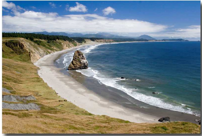
Cape Blanco looking South

Cape Blanco is the oldest original lighthouse in Oregon. Completed in 1871 it is recently restored and in very nice shape. The Cape Blanco area is very photogenic with great views to the north and south.