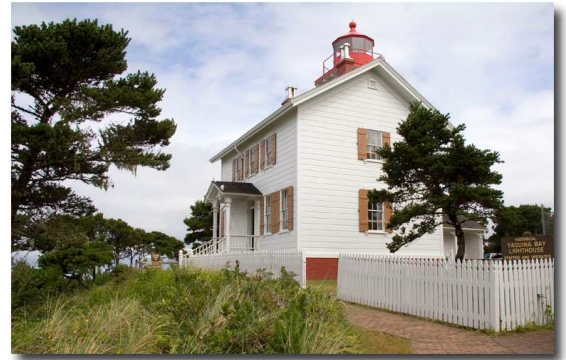
Yaquina Bay, Oregon

Heceta Head Lighthouse has tours available. There is a nice trail up to the lighthouse from a beach that's worth exploring also.