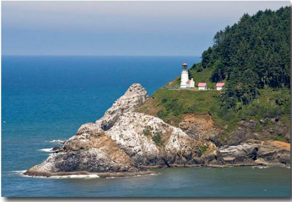
Heceta Head, Oregon

Heceta Head Lighthouse has tours available. There is a nice trail up to the lighthouse from a beach that's worth exploring also.