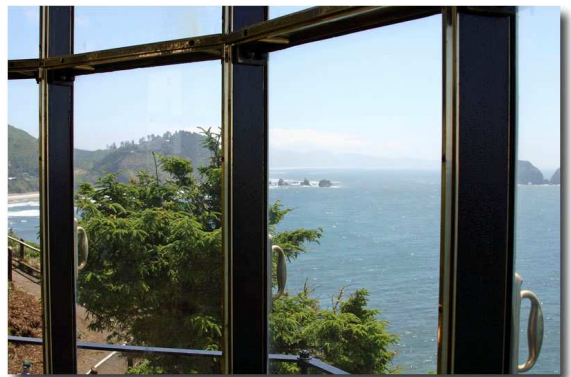
Cape Meares Lighthouse Window

Heading South towards Tillamook Oregon is Cape Meares. Cape Meares National