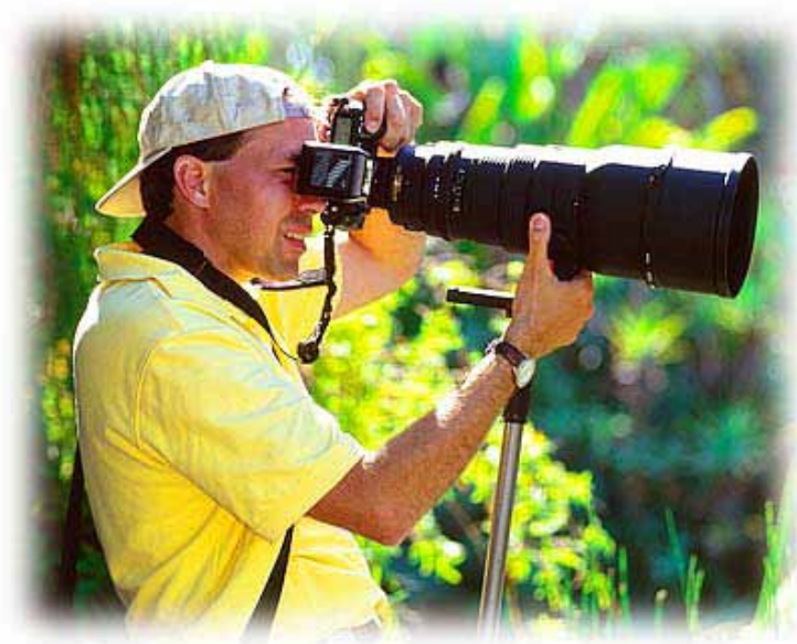
Ken Rockwell — Photographer